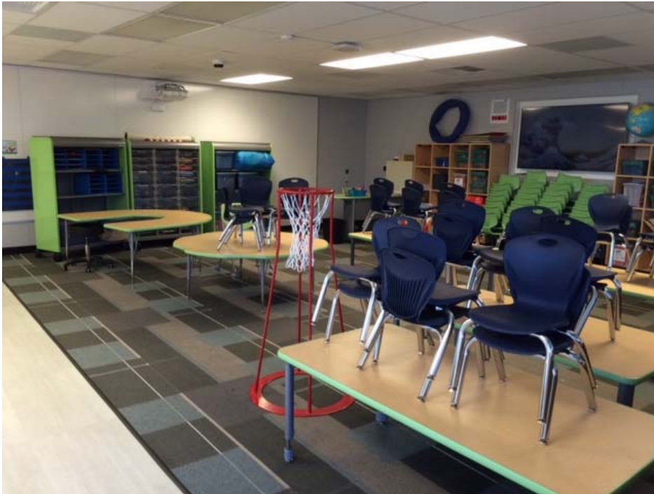
Room 3 – Friday, August 7 at 6:30 p.m.