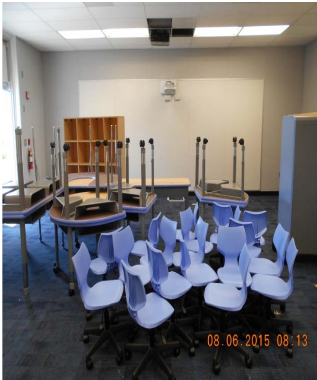
Furniture being Assembled