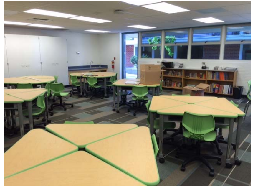
Saturday, August 8 at 5:00 p.m.