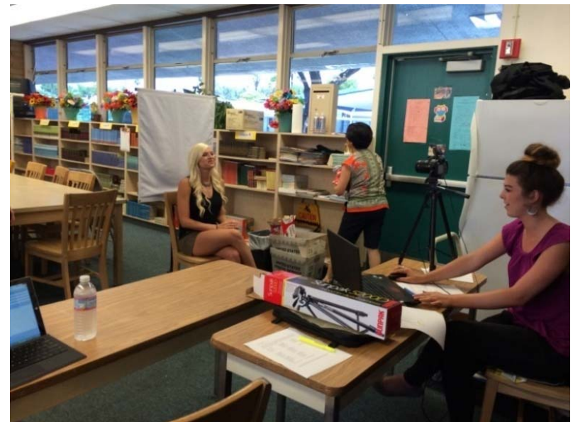
ID Badge Picture Taking