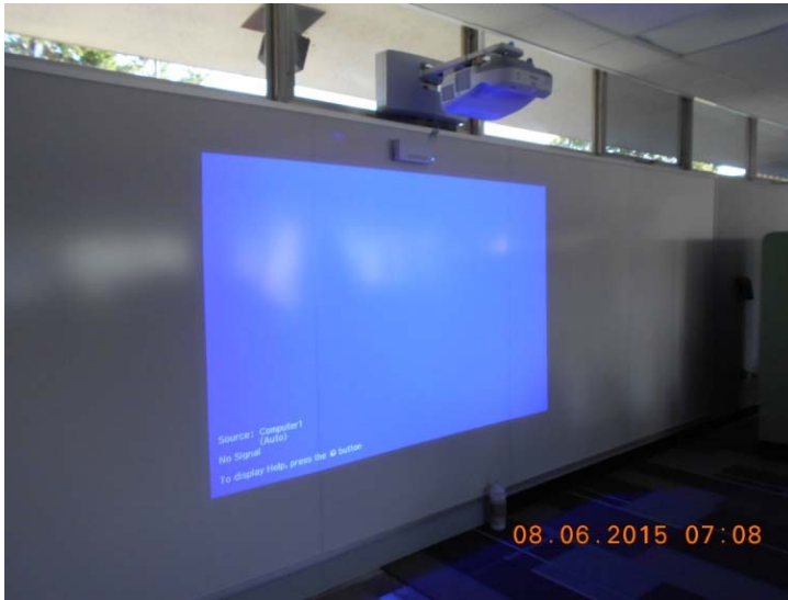
Interactive Projector with Wall Talker Board